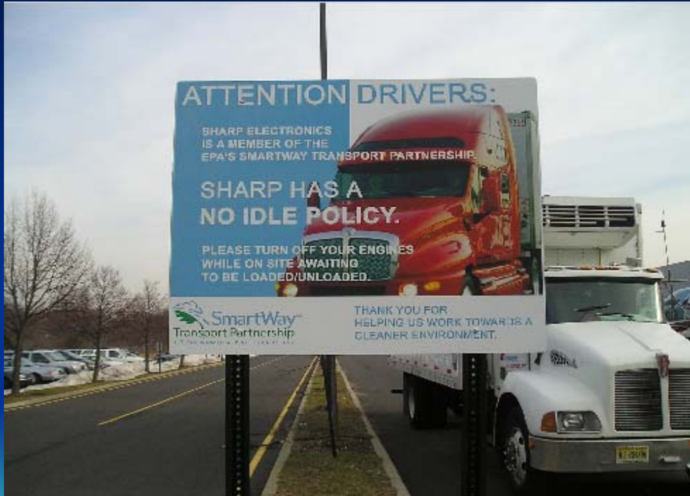
NO Idle Policy Sign placed Outside the Mahwah NJ Facility